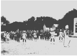
Early 1960's Wellsville Marching Band